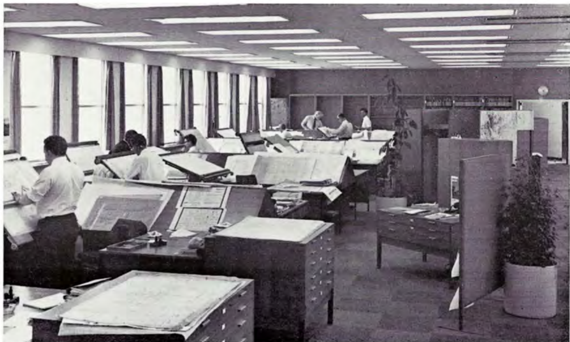
A corner of the Drawing Office where, as in all the other offices, shirt sleeves are the order of every day, thanks to the constant warmth—temperature 70 °F—maintained by the heat reclaim system.

internal audio dictating service. In the typing pool there is a bank of dictating machines and by dialling with one of the normal internal telephones which have a slight modification, one can dictate, play back and correct onto a disk from your desk just by manipulating a simple button set into the top of the telephone receiver stand.