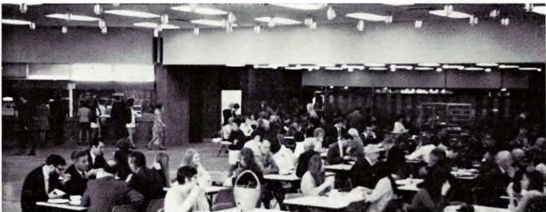
The busy lunchtime scene in the restaurant at Sealand Road. In addition to the normal 3-course lunch—with a reasonable menu—there is the Grill Bar where a range of meals are cooked on the spot. To the left of the picture is the shop where staff can buy sweets, cigarettes, etc.

At break-time staff congregate in one of the six coffee rooms, one on each floor, in which there are