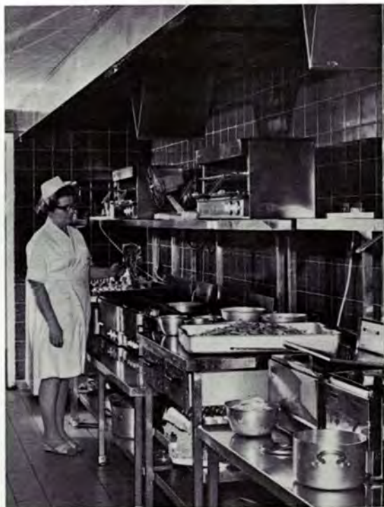
Below : In the Grill Bar, a quick service meal is being prepared. Steaks cooked while you wait, or, if you are a busy person, you can order by telephone and your meal will be ready when you are.

If touring the MANWEB building becomes too much for you and you feel a little faint, you can recoup in the rest room opposite the bank ( strategically placed for sufferers from overdrafts ) or you could undergo an examination in the well equipped surgery.