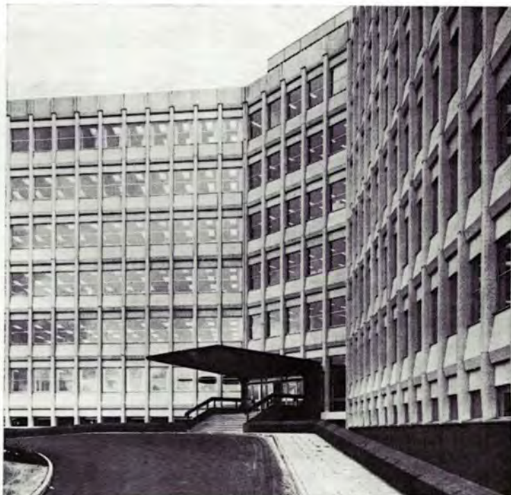
The imposing main entrance to the new building.