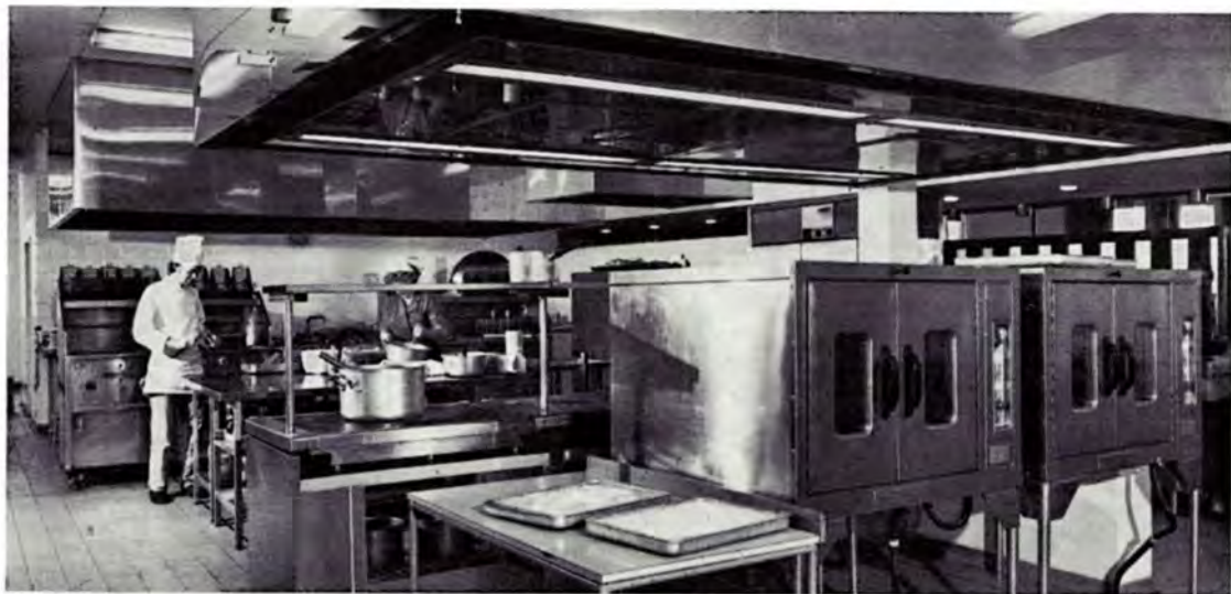
Above : The spotlessly clean and spacious all-electric kitchen where over 500 meals are prepared each day. In the right foreground are two of the latest forced-air circulation ovens.

hot and cold drink machines which provide an alternative of 15 different beverages—none of them alcoholic. There are also cold snack machines containing chocolate biscuits and the like.