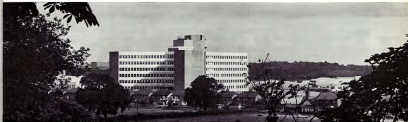
This striking picture of MANWEB's modern office block was taken from Blacon Point. It shows the East wing, on the left, and the South wing, on the right, with the West wing, end on.